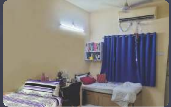
TWO SEATER AC